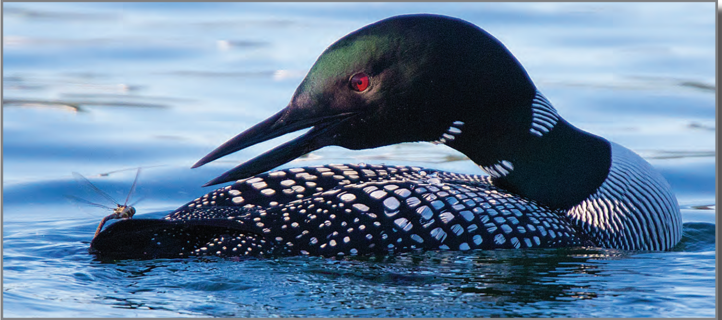
A DRAGONFLY AND A LOON —A loon reacts to a dragonfly landing on its tail feathers. (FEATURE)