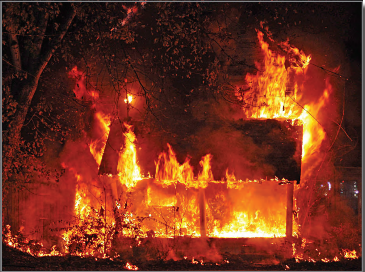
HOUSE FIRE —A vacant house on Park Street erupted in flames on Thursday, Nov. 19 in Falmouth. The cause of the fire was found to be arson. (NEWS)