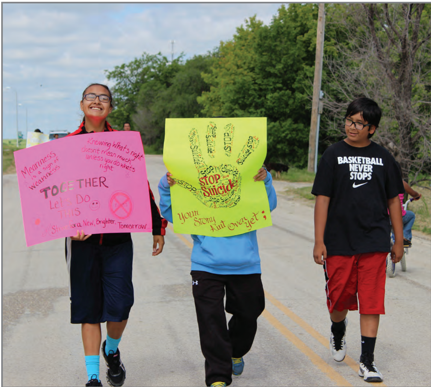
PROTESTING SUICIDE —Young people carried posters with messages about suicide in Parmelee. (NEWS)